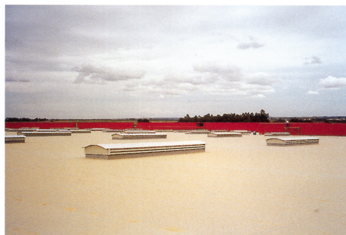
Neat appearance - sometimes a prerequisite

In the 6th issue of Rubberfuse newsletter, we explained why TPO/FPA Sintofoil ST (non-reinforced) is a valid, proven and competitive option for loose-laid/ballasted and mechanically attached roofing systems. While Sintofoil ST is used for over 80% of the Rubberfuse mechanically attached roofing systems installed so far, some customers however express their concern about aesthetics when this system is specified for their roof. Such concern has prompted Imper Italia to develop a line of reinforced Sintofoil membranes. The latest version, called Sintofoil RG, includes glass fibre that provides outstanding stability together with excellent wind-uplift resistance.